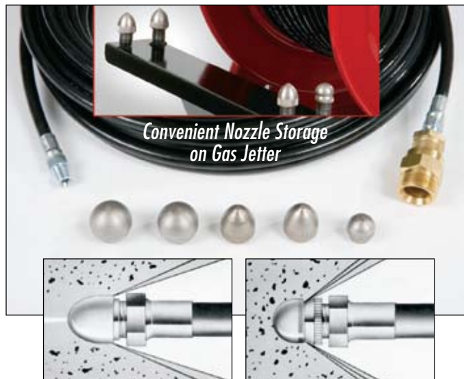
Convenient Nozzle Storage on Gas Jetter

Sludge. Ice. Grease. Sand. Soap. Dirt. Debris. Whatever the problem, Electric Eel steel nozzles will penetrate and clean tough problems from pipe walls with a variety of spray angles.